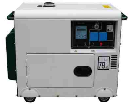
For illustration purpose only

This quality generator, created by Ignite Power is ideal for home and small businesses. It comes as 5KVA diesel generator. Ideal for all kinds of seasons, we have enhanced its capacity (thermodynamics) to endure / work in hot climate without interruptions. With low fuel consumption and low maintenance cost, it is ideal machine for the long run.